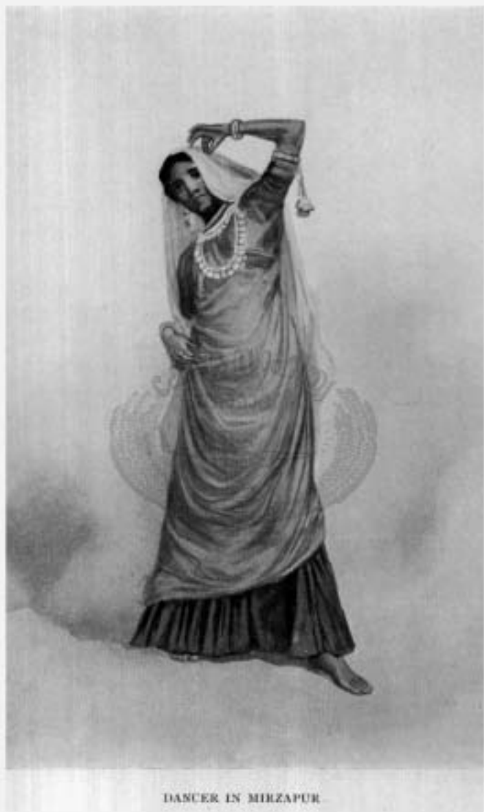
DANCER IN MIRZAPUR